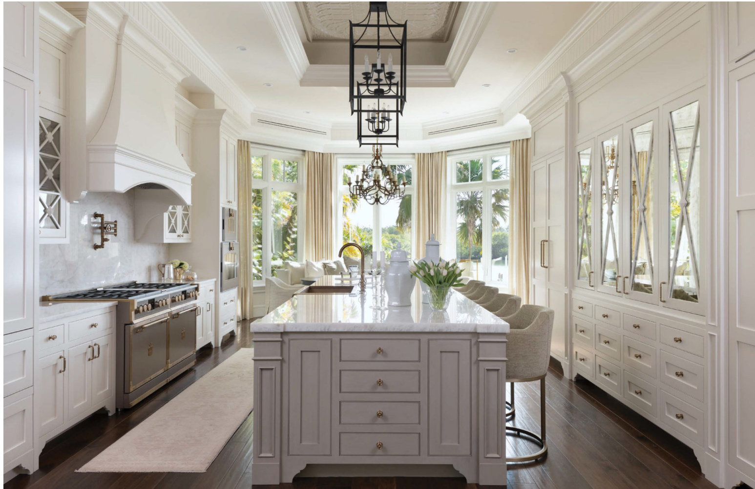
LEFT: In the kitchen, bespoke lighting fixtures hang over a large gray marble island that anchors the room. Per the homeowners, the space was modernized to satisfy modern lifestyles.