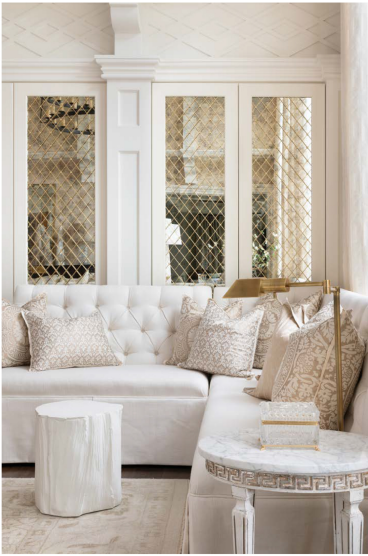
BELOW: Nestled in a corner of the living room is an L-shaped banquette and a cocktail table where guests can congregate.

Overlooking Champney Bay and surrounded by trees, the 8,000-square-foot house (with six bedrooms and seven-and-a-half baths) boasts resort-style exteriors with multiple terraces, a koi pond,